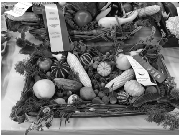
Friend of the Grange